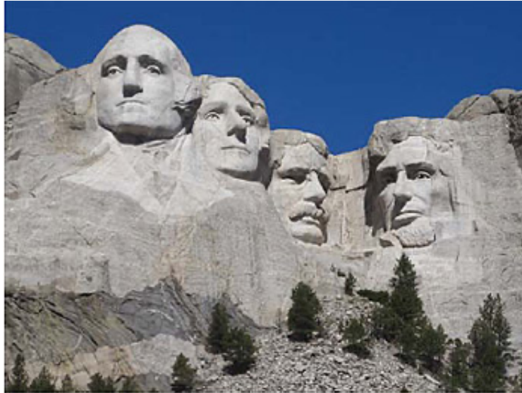
Could the images on Mount Rushmore have been formed accidentally through natural erosion?